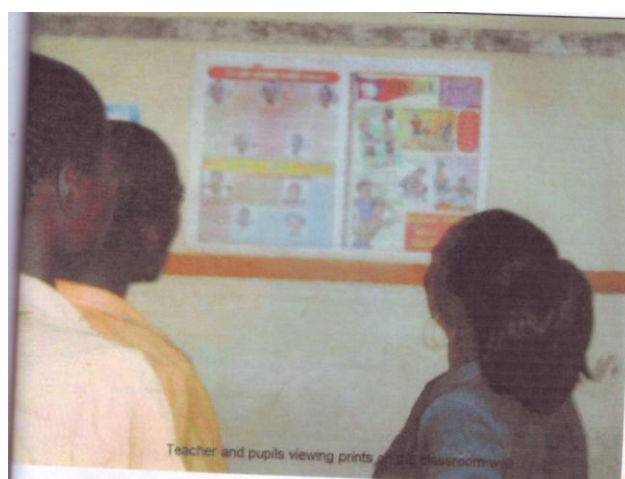
Teacher and Pupils viewing prints on the Classroom wall