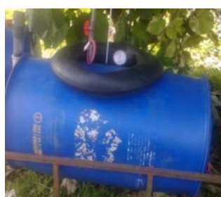
Fig 6. Biogas generated from pig waste