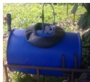
Fig 7. Biogas generated from cow dung