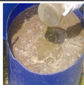
Fig 4. Pig waste

The digester was stirred occasionally by all round mixing and shaking together of the plastic digester. A thermometer was used to measure the temperature. The temperature of the slurry was observed daily at 30 minute interval for 8 days from 8.00hrs to 17.30hrs through the thermometer that was inserted into the digester. The ambient temperature was also measured with another thermometer. The biogas generated was analyzed using a GC HP 68900 with HP ChemStation Rev A 09 01 [1206] Software to determine the constituents and percentage composition of each gas contained in biogas generated.