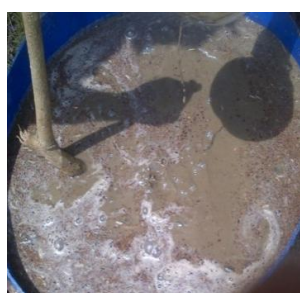
Fig 2. Chicken waste