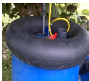
Fig 5. Biogas generated from chicken waste

The three digesters produced gas suspected to be biogas with chicken waste generating gases within 24 hours of loading, pig waste generating gases after three days of loading and cow dung generating gas after seven days of loading. It was also observed that Chicken waste generates the highest volume of gas (Figure 5) followed by pig waste (Figure 6) and cow dung generates the least volume of gas (Figure 7) as evident in the size of the tyre tubes after opening the gas valve. Pressure is also observed to be constant throughout the retention days.