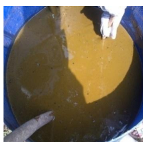
Fig 3. Cow dung