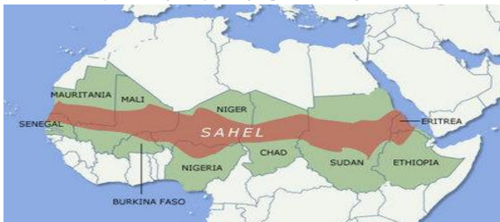
Fig1. Sahel Region Map

In order to understand the security challenges confronted by the countries of the Sahel, it is necessary to begin with the specific details of geography and the sociological make-up of the region, it is important to recall that the Sahel region, which covers the expanse stretching from the Atlantic to the Red Sea and encompasses parts of Senegal, Mauritania, Burkina Faso, Algeria, Niger, Nigeria, Chad, Sudan, and Somalia, is more than 80 percent comprised of desert lands. Hence, the Sahel spreads from Mauritania and Senegal in the west of Africa to Sudan and Eritrea in the east, The Sahel is a critical zone of convergence. Geographically, it links two oceans and three seas. Itself a semi-arid corridor, it functions as a giant dry river that traverses the central-north of Africa from coast to coast, demarcating the transition between the Sahara desert and the savannah. Across the land and the water came traders and adventurers seeking goods and power, bringing ideas, opportunities and challenges, sometimes, as with slavery, inflicting heavy damage upon flourishing institutions. 1