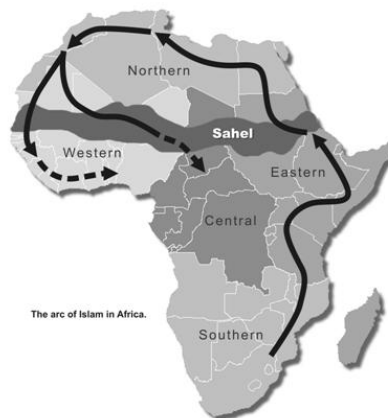
Fig2. The arc of Islam in Africa

While the risks of escalation are significant, the gains of these Islamic militant groups are not attributable to their military strength. Rather, their expanded influence is just as much a symptom of fragile and complex political contexts. More generally, Islamic militancy in Africa today represents the intersection of broader trends in contemporary Islam and local circumstances. Responding to the challenge is all the more difficult in that very little is known about these often secretive Islamic groups, some of which have only recently emerged. 14 Yet, political and socioeconomic factors are important, the very fact that these movements define themselves in religious terms makes it imperative to recognize their ideological content. Islamic militancy in Africa is part of a broader, global ideological current. In some cases, this includes links to like-minded organizations outside Africa. Unfortunately, the lack of thorough investigations of such connections often reduces the complexity of such ideological bonds to the diffuse notion of “global Islam.” In fact, contemporary Islam is characterized by increased doctrinal heterogeneity and fragmentation, which inevitably impact the on-the-ground actions of Islamic militants. Groups feature a high degree of selective interpretations of religious tenets, particular local appropriations, and a lack of ideological coherence that propel them on multiple potential trajectories that can be difficult to chart. 15